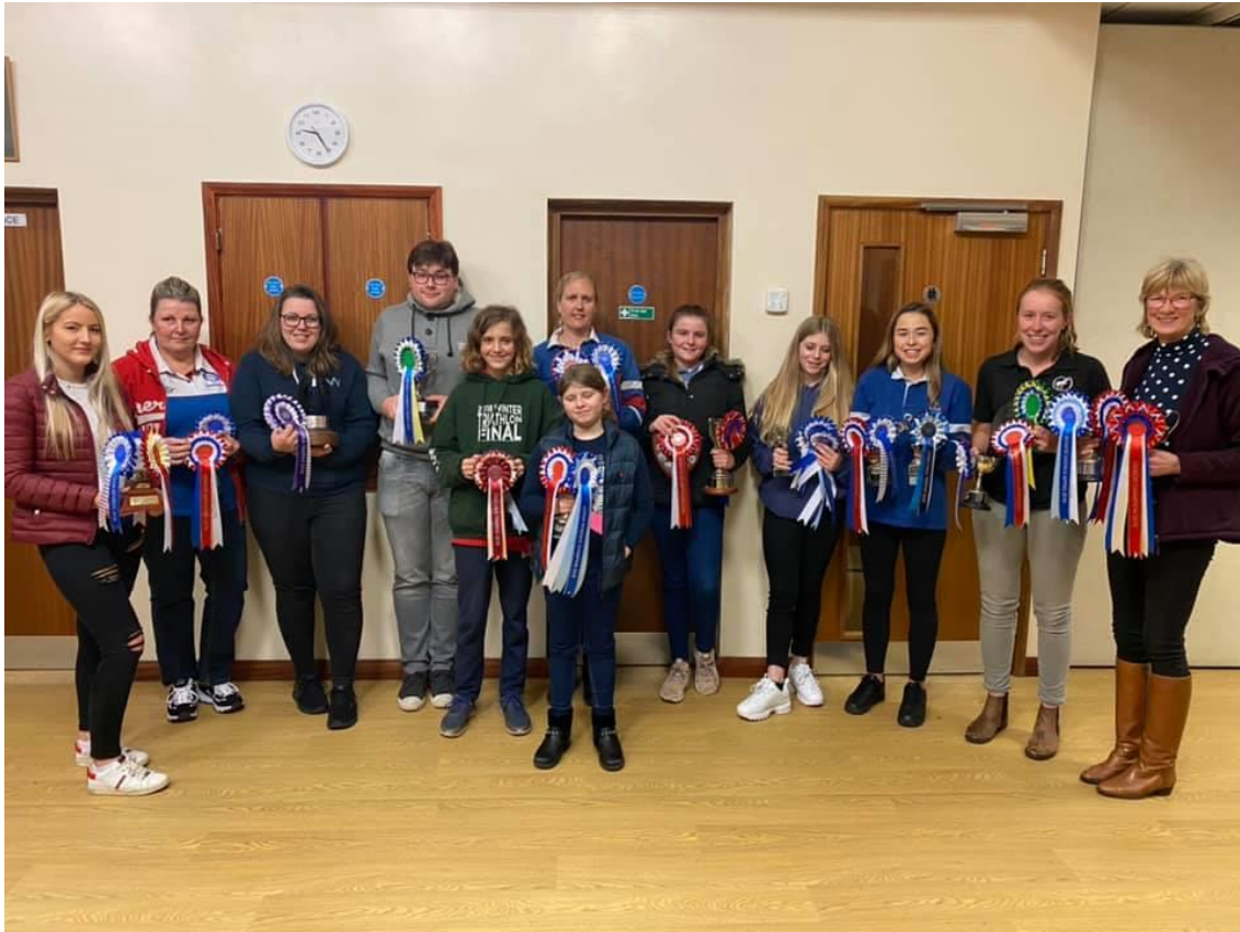
Congratulations to all of the ERC Trophy Winners at the AGM